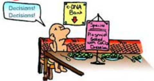
Genetically modified foods.