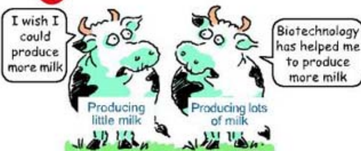
Biotechnology used in dairy farming