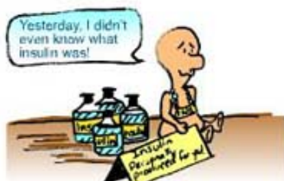
Pig insulin was used before human insulin was cloned into bacteria.